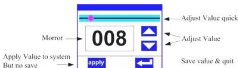
chart4 Value setting page

When the selected parameter item needs to enter a value, the window as shown in Figure 4 will open: